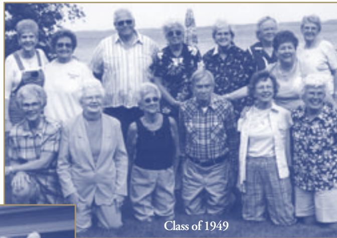
Class of 1949