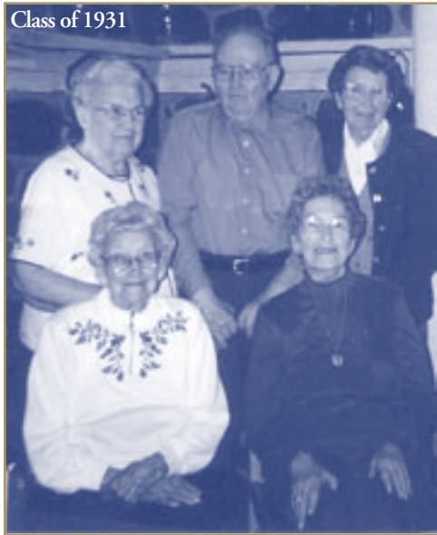
Class of 1931